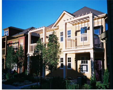
Mixed-Income Development, Denver, CO

REALITY: Wealthy homeowners benefit the most from federal housing subsidies. They receive a federal income tax deduction for mortgage interest paid, which is the largest housing subsidy program in the U.S., and a similar deduction for property taxes paid. In 2003, the federal government spent $57.2 billion in housing-related tax expenditures to households in the top income quintile alone.