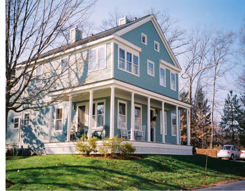
Mixed-Income Condo Development, Lincoln, MA

REALITY: Repeated research has shown that affordable housing has no negative impact on the price or frequency of sales of neighboring homes. A recent study of four very-low-income family housing developments in suburban Chicago – Victorian Park in Streamwood, Liberty Lakes Apartments in Lake Zurich, Waterford Park Apartments in Zion, and Brookhaven Apartments in Gurnee - revealed that affordable housing can have a positive impact on