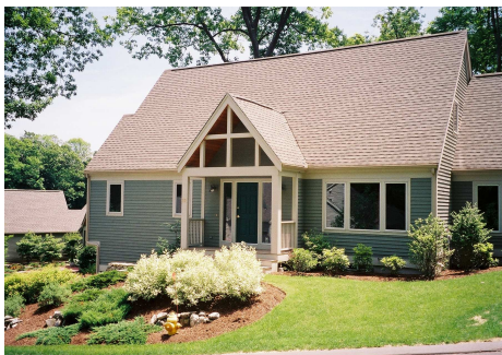
Mixed-Income Single-Family Home Development, Weston, MA

REALITY: Nationwide, the effective tax rate (property tax paid relative to the market value) for multi-family complexes is significantly higher than single-family homes. 10 Thus, multi-family developments pay their "fair share" in local property taxes. A Massachusetts study of 41 towns found that multi-family complexes often generated a profit for local governments. 11 Most cities that have enacted inclusionary zoning ordinances have found that they spur more than enough economic development to keep public finances on a sound footing. 12 Furthermore, as stated above, multi-family housing offers greater efficiency in