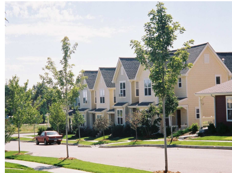
Mixed-Income Single-Family Development, Boulder, CO

REALITY: Affordable housing must comply with the same building restrictions and design standards as market-rate housing. Builders know that it makes sense to use the same construction techniques and materials for all units in a development. Furthermore, because affordable housing is often funded in part with public money, sometimes it needs to comply with additional restrictions and higher standards than