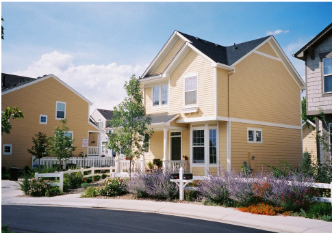
Mixed-Income Development, Longmont, CO

MYTH: Affordable housing is not fair; only the very poor benefit.