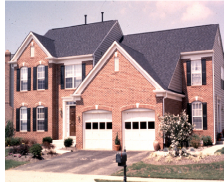
Mixed-Income Development, Montgomery County, MD

REALITY: Without affordable housing, many families are forced to move frequently, and their children are unable to remain in the same school for long. A Minneapolis study found that children whose families moved during the course of the school year attended school less often and scored significantly lower on standardized tests than those who stayed in one place. 6 Research on Chicago-area residents reveals that students forced to move around are much more prone to drop out of school. 7 Affordable housing minimizes such disruptions to children's education.