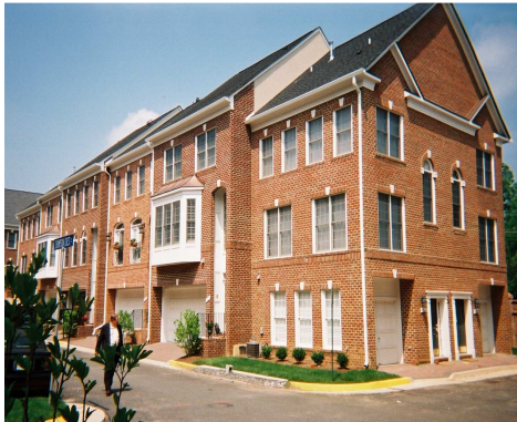
Mixed-Income Townhome Development, Fairfax County, VA

MYTH: Affordable housing will increase crime in the community and bring in undesirable residents.