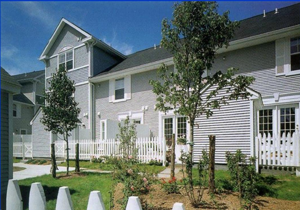
Waterside Green, Stamford, Connecticut