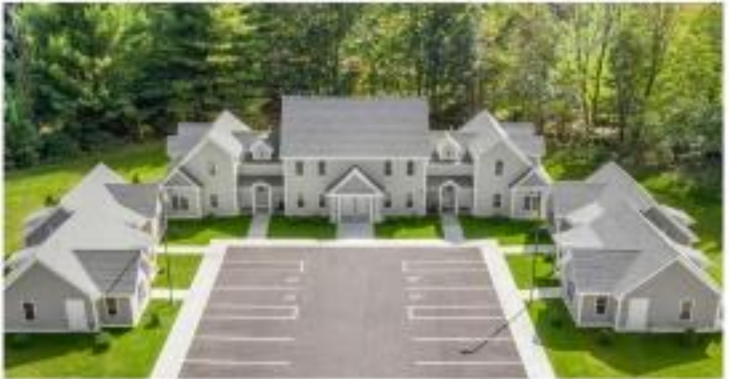
Sarum Village II, Salisbury, CT