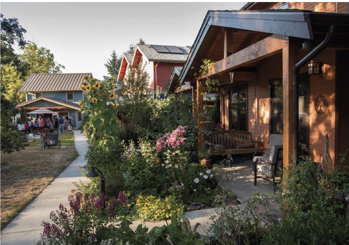
Cully Grove, Portland, OR, 16 Units