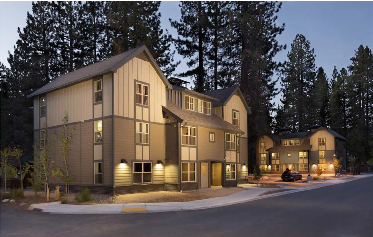
Kings Beach Housing, Lake Tahoe 77 units