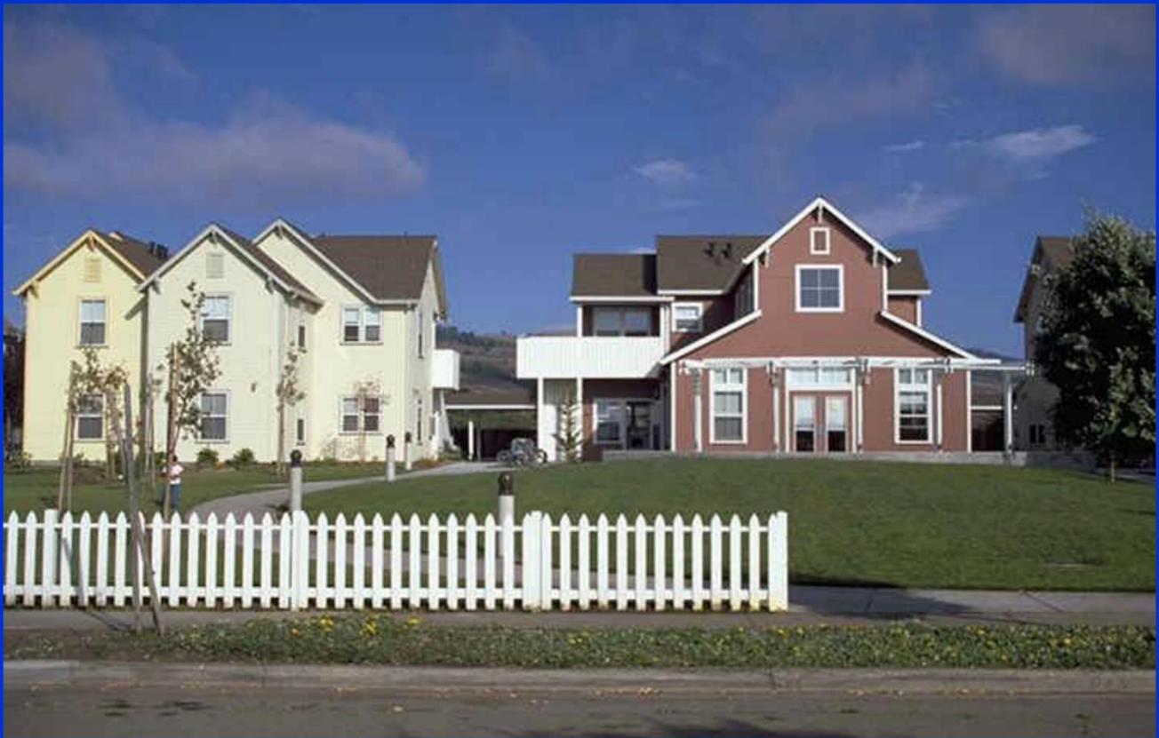
Main Street Park, Half Moon Bay, California