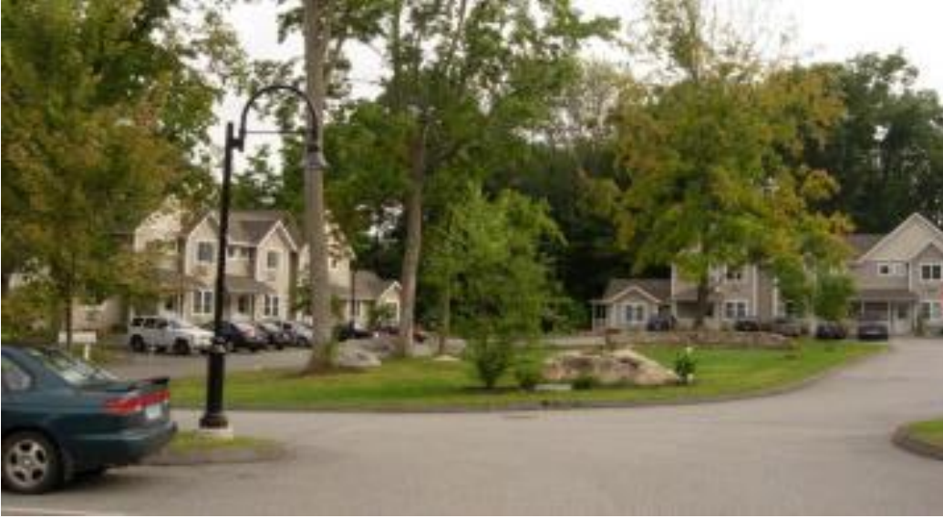
South Common, Kent, CT