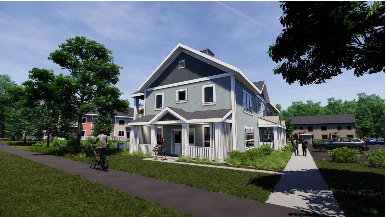
Mansfield, CT 42 Units