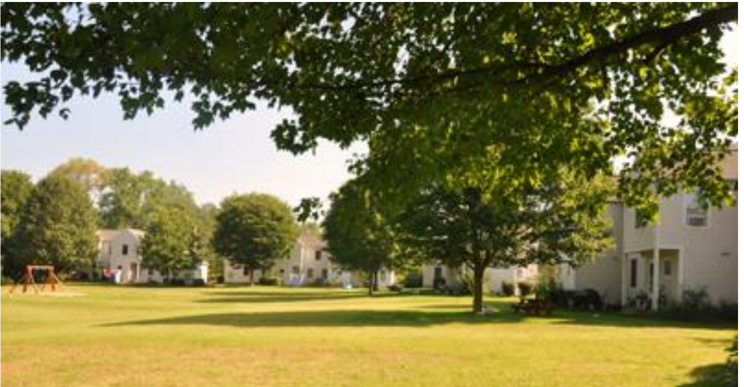
Kugeman Village, Warren, CT