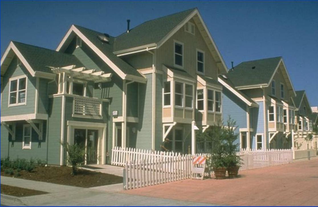
Jingletown Homes, Oakland, California