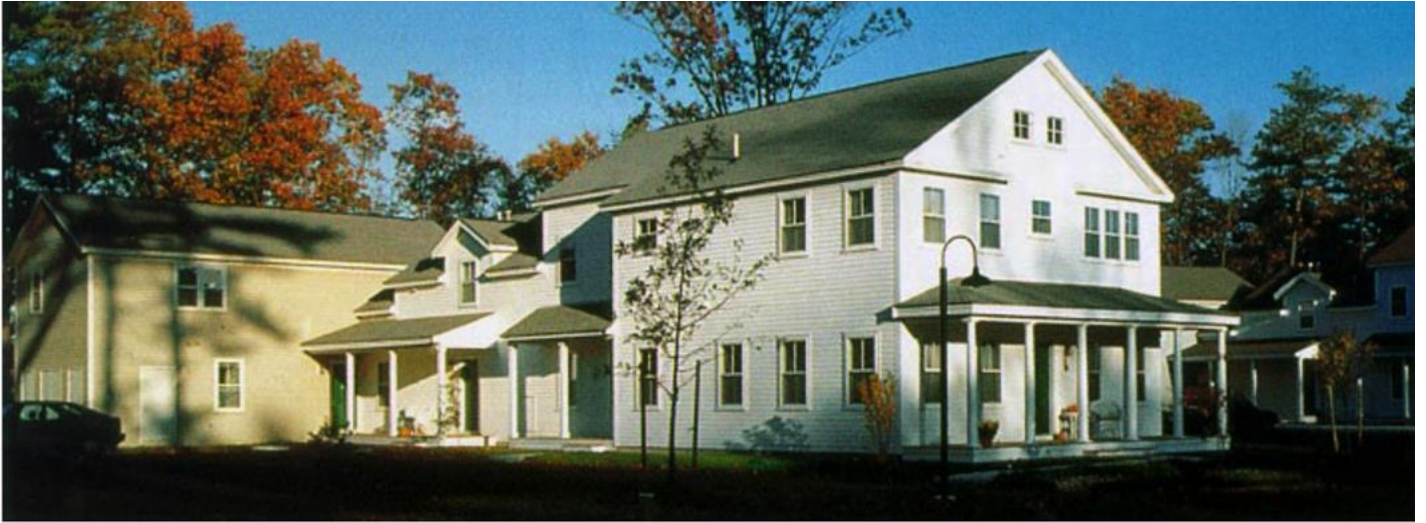
Battle Road, Lincoln 48 units