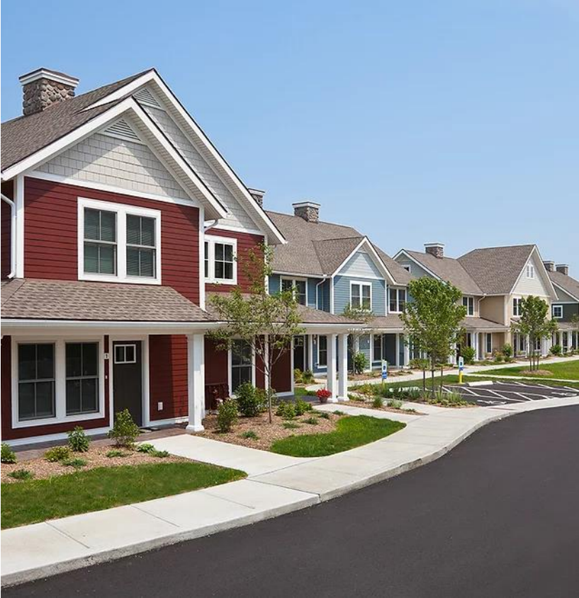
Ferry Crossing, Old Saybrook, CT