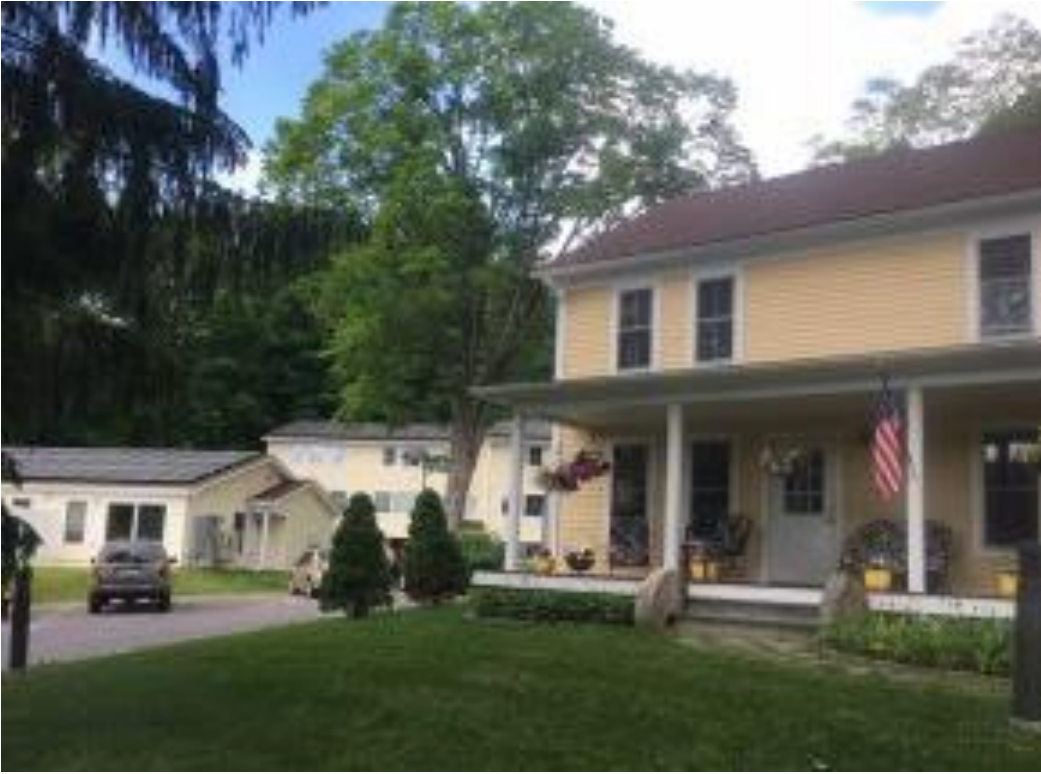
Stuart Farms Apartments, Kent, CT