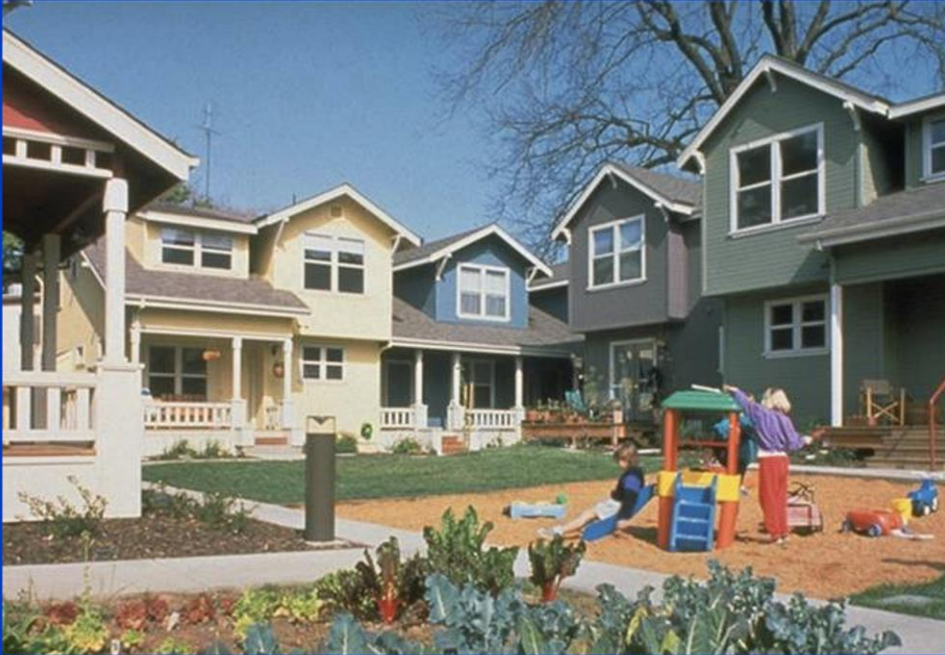
Southside Park, Sacramento