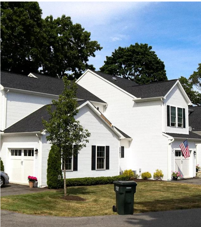
Wellington, Madison, CT