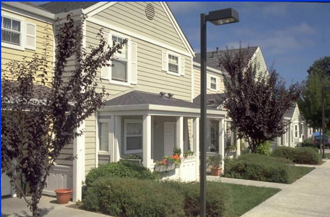
Lavell Court, Sonoma County, California