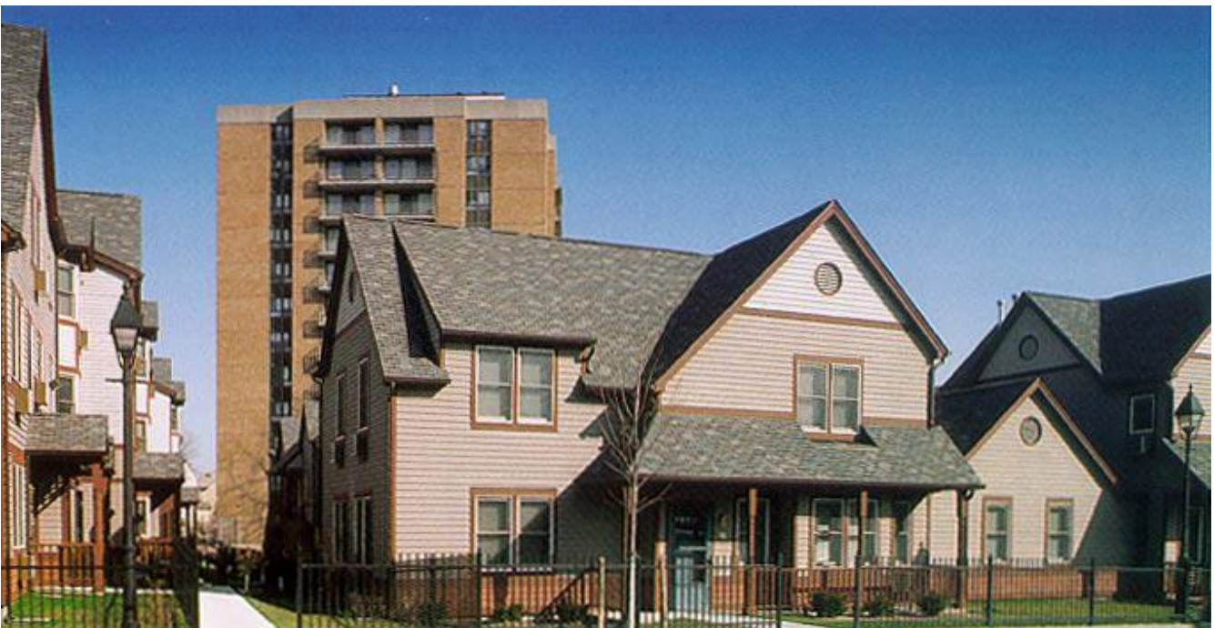
Parkside Gables, Stamford, CT 29 units per acre